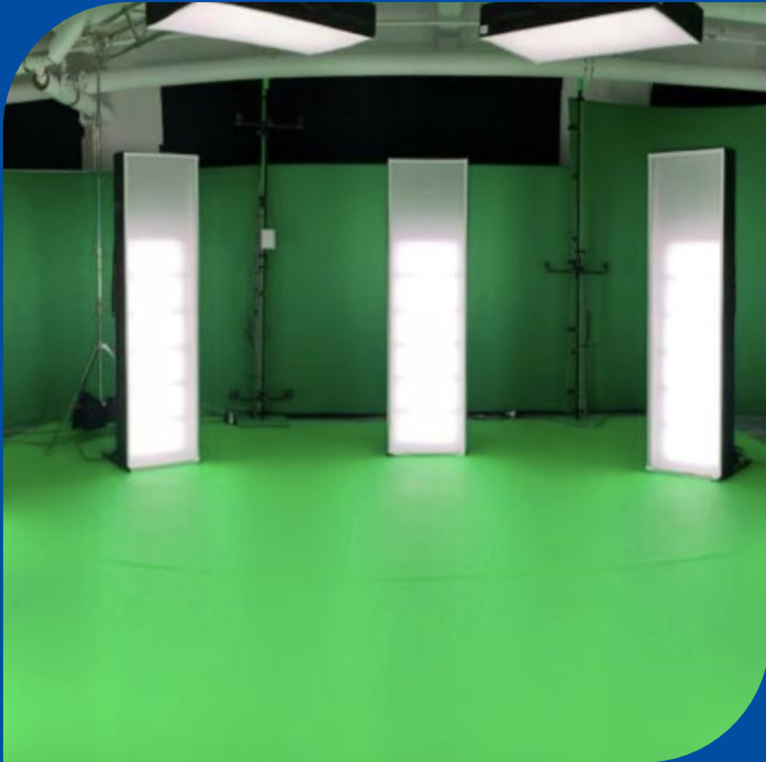
Technology & Business Innovation