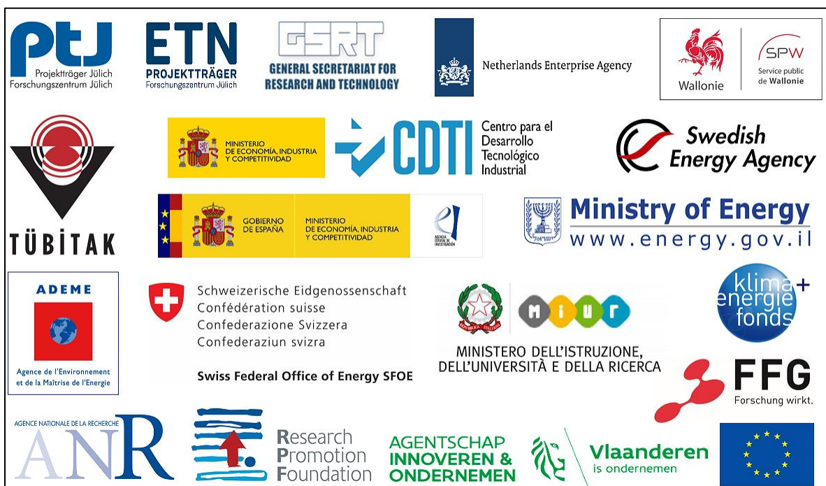
Figure 1: Organisations involved in promoting the SOLAR-ERA.NET Cofund 2 Joint Call and providing support and funding to innovative transnational projects.

The participating national SOLAR-ERA.NET partners / contact points are listed in Table 1. Each applicant have to check the project idea with the national contact point as early as possible in the preproposal phase, at the latest before submitting any applications.