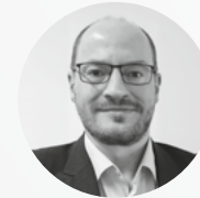
Klaus Puchbauer-Schnabel High Level Representative