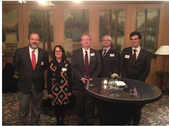
(from left to right)

In addition to the presentation and discussion sessions 70 individual meetings have been organized to provide all participants the opportunity to meet and discuss in detail the international cooperation modalities and processes bilaterally.